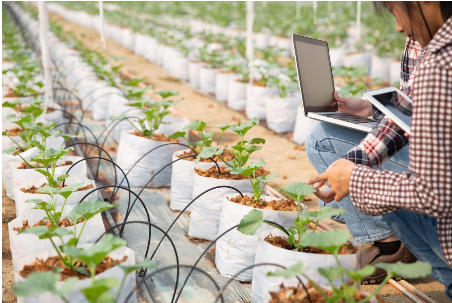
Young woman controlling a plantation